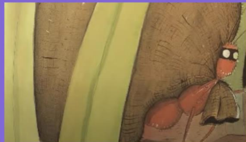
Plot 4: Climax