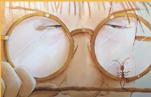
Plot 3: Rising Action